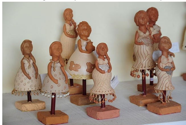
Figure 2 - Stylized dolls - Women of Poty

As part of the formalization under the cooperative mode, the artisans had contact with a recently graduated architect interested in the innovation of production, suggesting the creation of stylized dolls. Initially, the architect presented a proposal for dolls based on the artisans' life history, which was modified by them, attributing their own personalities and characteristics, revealing the artisans' identity. Five dolls were created, shown in Figure 2.